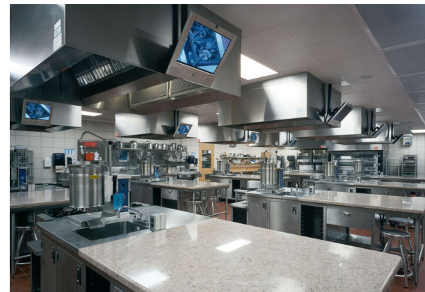
COVER: Production Line TOP LEFT: Schoolcraft College VisTaTech Culinary Training Center BOTTOM LEFT, RIGHT: Qatar Airways Catering Facility